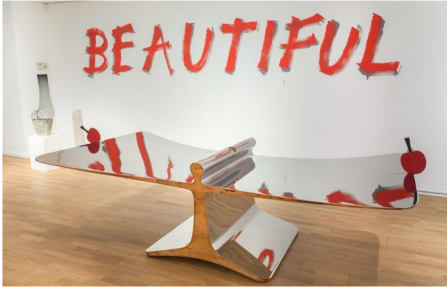
Ron Arad, Ping Pong (2007).

Exhibition: “Beautiful, Useful, Love: Ron Arad”