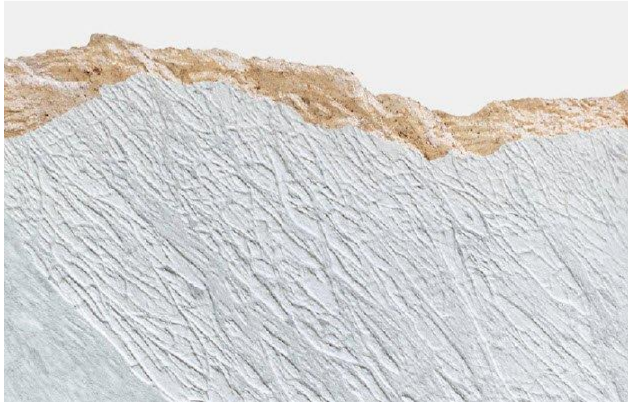
Giuseppe Penone, Pelle del mont detail (2012).

Exhibition: “Giuseppe Penone: Selected Works”