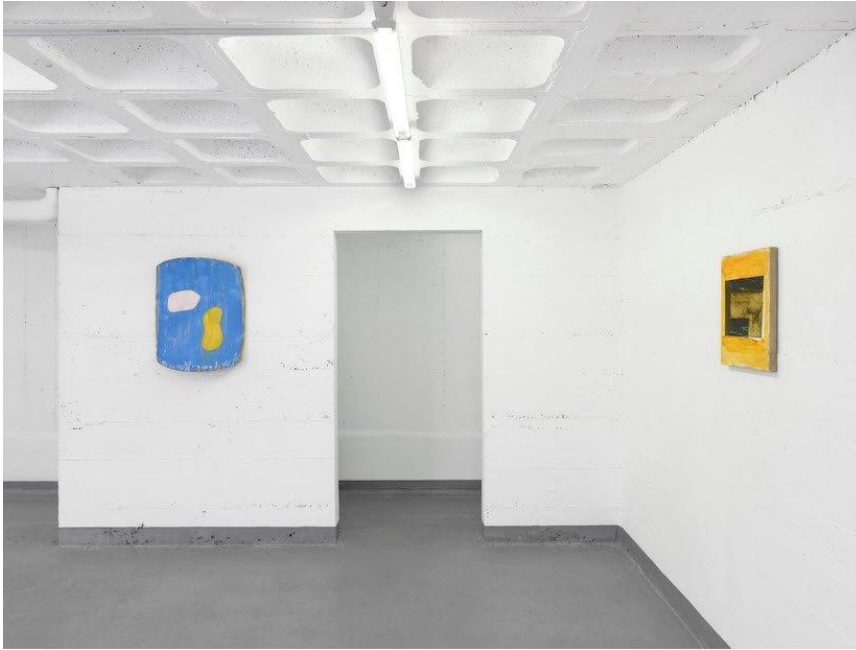
“Gorchov / Lindman / Provosty” installation view.

Exhibition: “Gorchov / Lindman / Provosty”