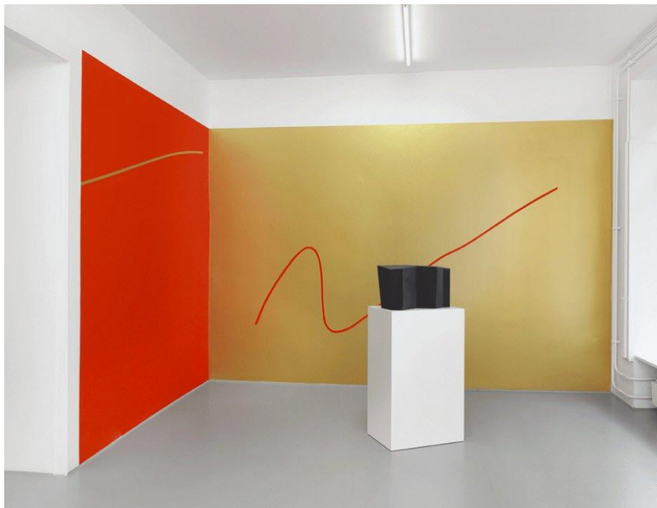
“John Armleder: Hors Sujet” installation view.

Where: Gagosian, 19 place de Longemalle, Geneva, Switzerland