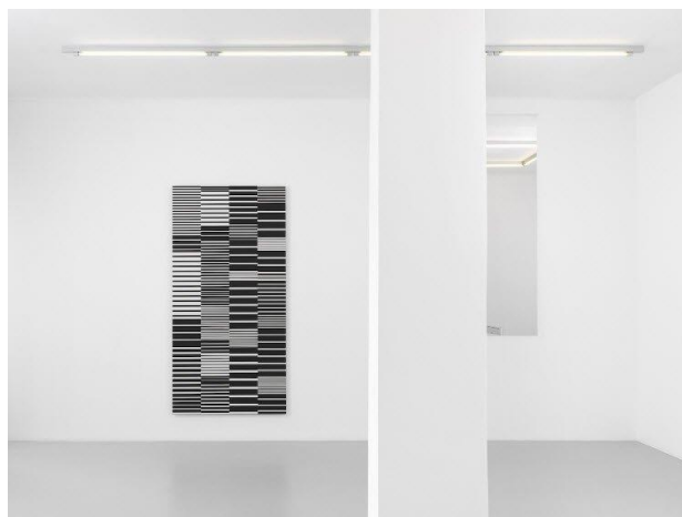
Michael Scott, installation view.

Where: Art Bärtschi & Cie , 24 rue du Vieux-Billard, Geneva, Switzerland