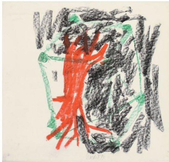
Georg Baselitz, Untitled (1993). Courtesy of Art Bärtschi & Cie.

Where: Galerie Artvera’s , 1 rue Etienne Dumont, Geneva, Switzerland